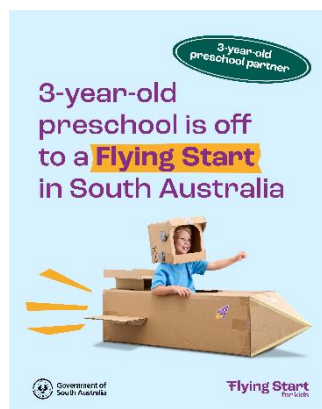
Tile 2: Announcing the launch

#FlyingStart #MyFlyingStart #3yearoldPreschool