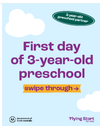
Tile 1: Photos from your launch week

You can use these suggested social media tiles on your channels to share the excitement of universal 3-year-old preschool launching at your service. Before sharing any images of children online, make sure you have the correct consent forms in place. You can download the image files in the Partner Portal: